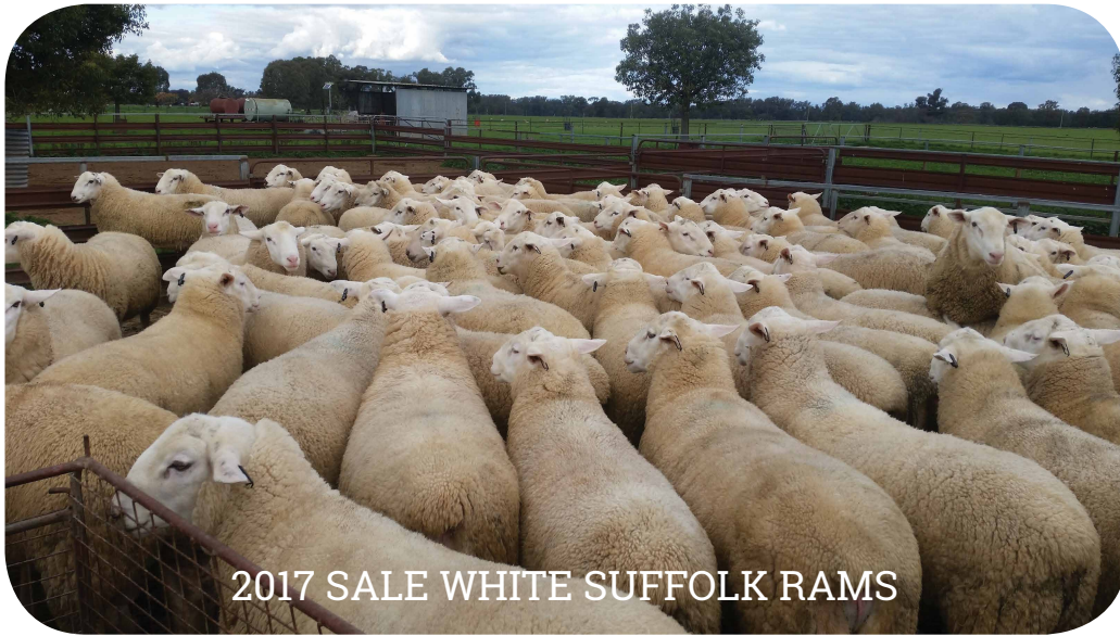
2017 SALE WHITE SUFFOLK RAMS