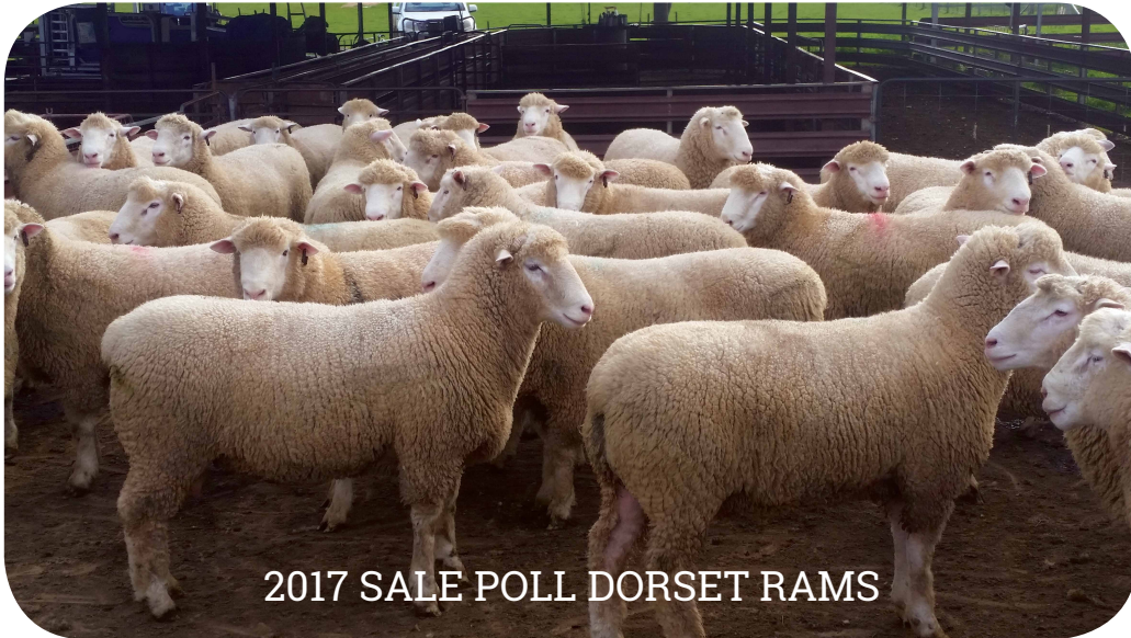
2017 SALE POLL DORSET RAMS

Our annual Spring Ram Sale will be on Wednesday 4th October 2017 on property at Kismet Howlong NSW with inspections from 11am and the sale kicks off at 1pm. The rams are performance tested through Stockscan and all the figures are available on the day or can be found on our website ( www.kismetstud.com.au/ramsale ). We are fully accredited for Brucellosis and are MNIV in the MAP programme.