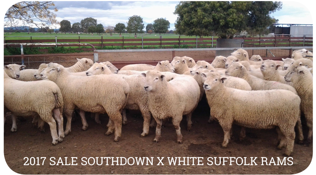
2017 SALE SOUTHDOWN X WHITE SUFFOLK RAMS