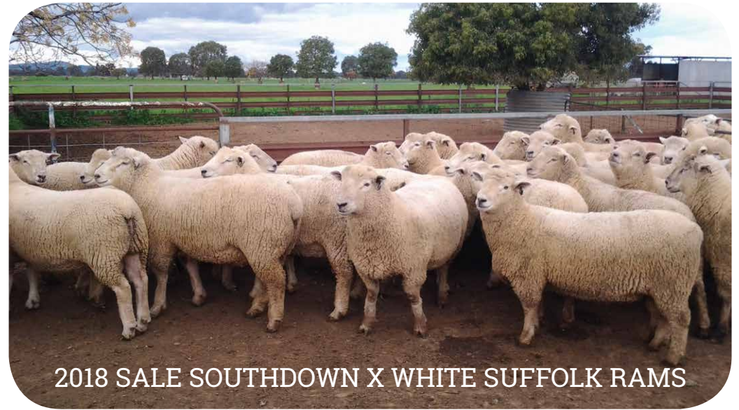
2018 SALE SOUTHDOWN X WHITE SUFFOLK RAMS