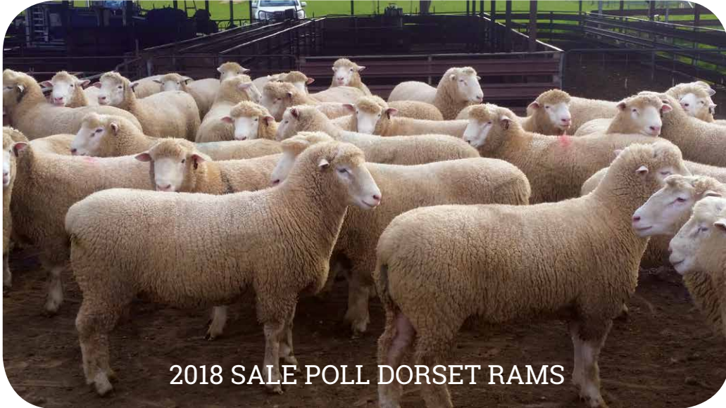
2018 SALE POLL DORSET RAMS

Our annual Spring Ram Sale will be on Wednesday 3rd October 2018 on property at Kismet Howlong NSW with inspections from 11am and the sale kicks off at 1pm. The rams are performance tested through Stockscan and all the figures are available on the day or can be found on our website ( www.kismetstud.com.au/ramsale ). We are fully accredited for Brucellosis and are MNIV in the MAP programme.