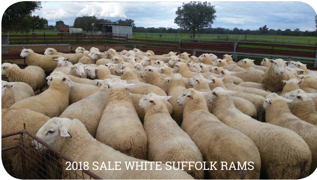
2018 SALE WHITE SUFFOLK RAMS