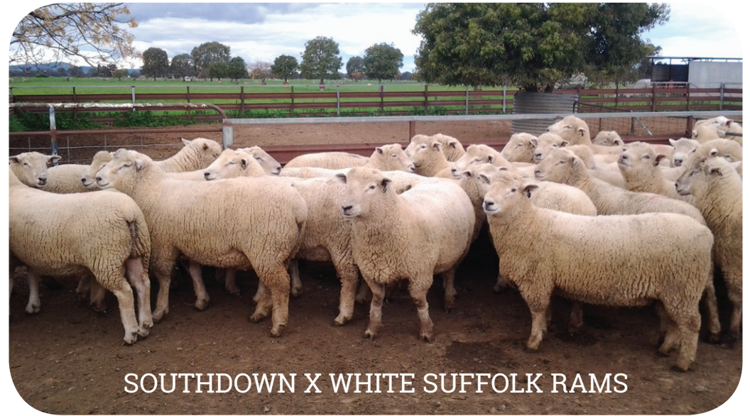
SOUTHDOWN X WHITE SUFFOLK RAMS