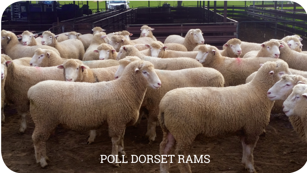
POLL DORSET RAMS

Our annual Spring Ram Sale will be on Wednesday 3rd October 2018 on property at Kismet Howlong NSW with inspections from 11am and the sale kicks off at 1pm. The rams are performance tested through Stockscan and all the figures are available on the day or can be found on our website ( www.kismetstud.com.au/ramsale ). We are fully accredited for Brucellosis and are MNIV in the MAP programme.