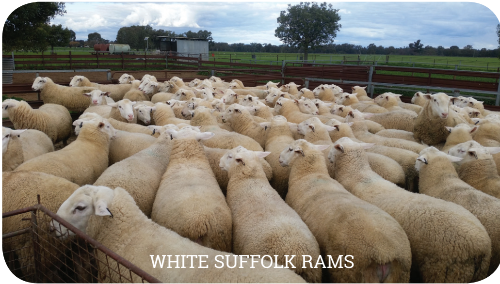
WHITE SUFFOLK RAMS