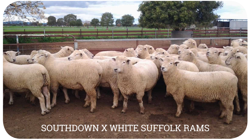
SOUTHDOWN X WHITE SUFFOLK RAMS