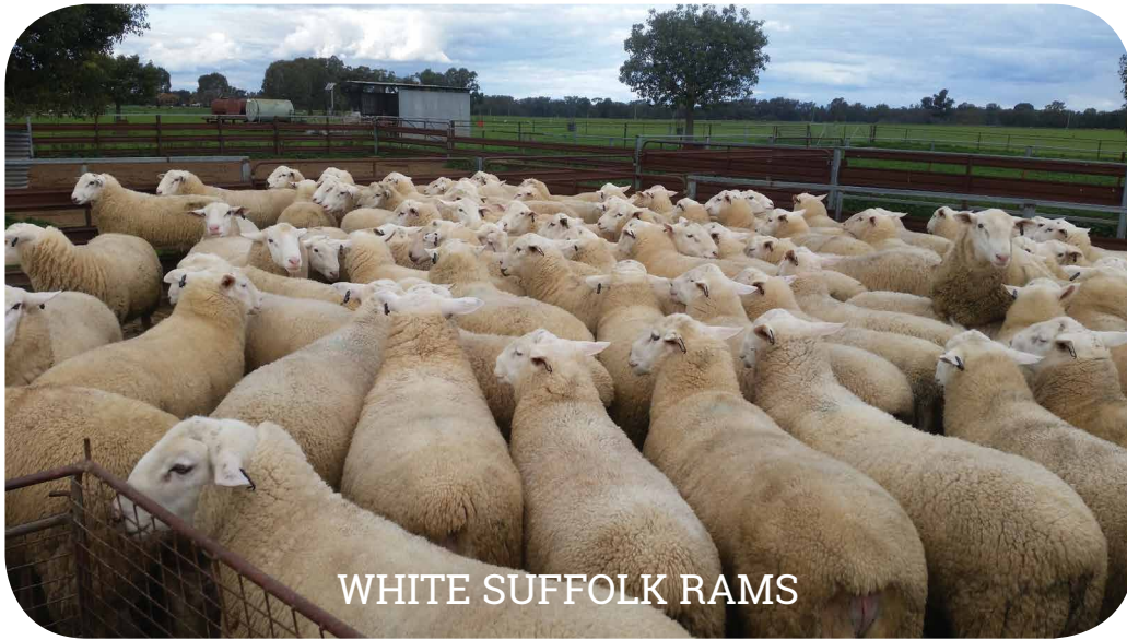
WHITE SUFFOLK RAMS