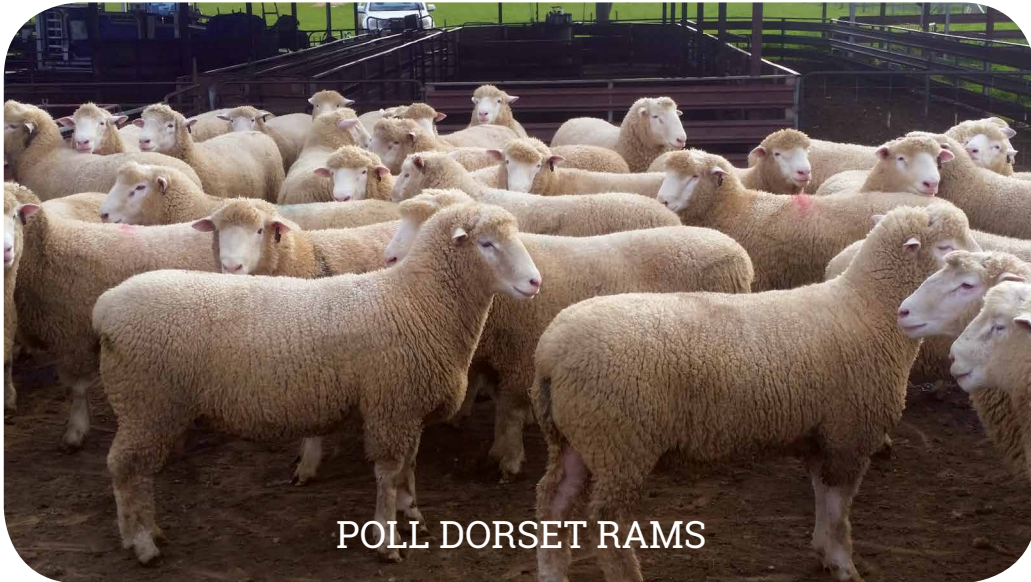
POLL DORSET RAMS

Our annual Spring Ram Sale will be on Wednesday 2nd October 2019 on property at Kismet Howlong NSW with inspections from 11am and the sale kicks off at 1pm. The rams are performance tested through Stockscan and all the figures are available on the day or can be found on our website ( www.kismetstud.com.au/ramsale ). We are fully accredited for Brucellosis and are MNIV in the MAP programme.